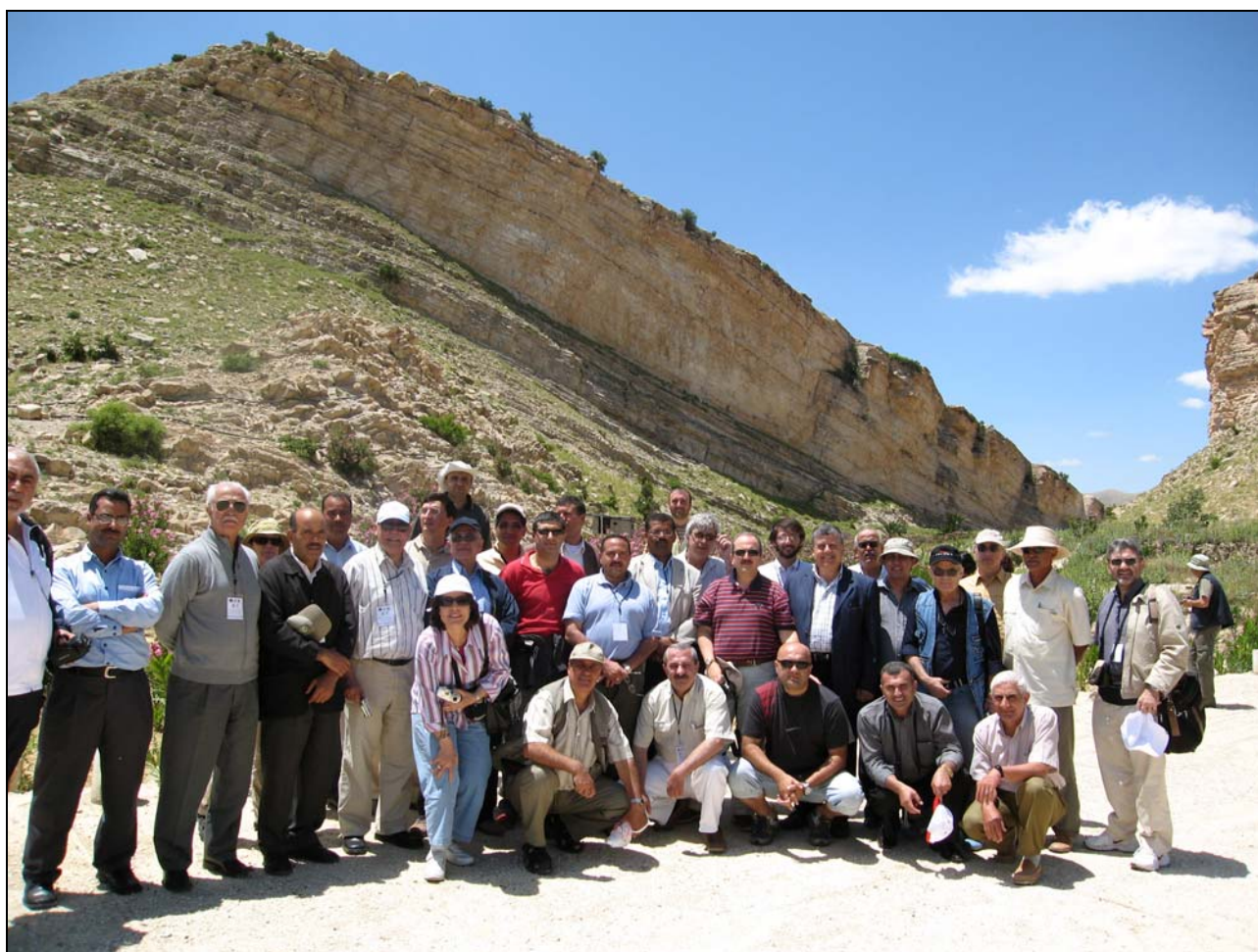
Participants during the technical visit in Kairouan in 29 May 2007