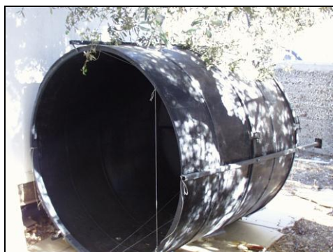
Figure 1: The Main Body of the Plant with the Attached Metal Frame

plant. This tank was attached to a metal frame that was painted with a corrosion protective coating and consisted of three rings linked together by three parallel profiles that were perpendicular to the three rings and fixed with a displacement between each other of 120 degrees from the center of the rings, as shown in (Figure 1). Later on, Polyethylene rigid high density polyethylene-HPPE sheets were added to form the divisions between the different zones of the wastewater treatment reactor.